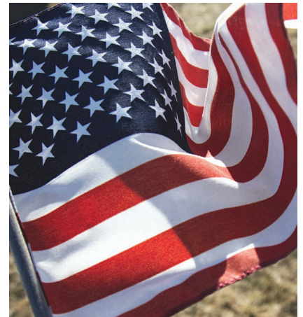
Happy 4th of July!