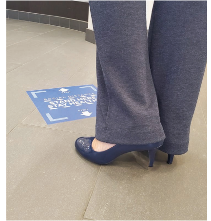
Floor decals help members with social distancing